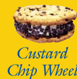
Custard Chip Wheel